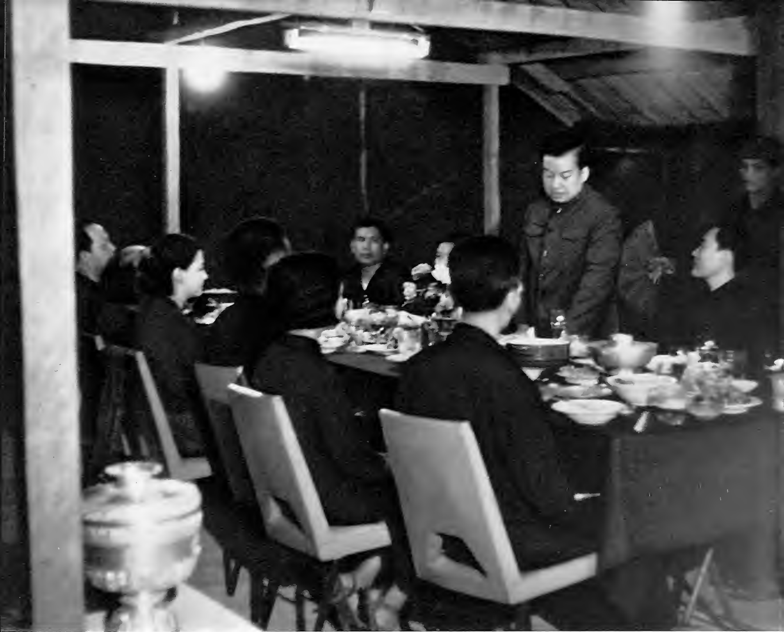
Samdech Sihanouk delivering a speech of thanks at a banquet given in his and Madame Sihanouk's honour by the R.G.N.U.C.